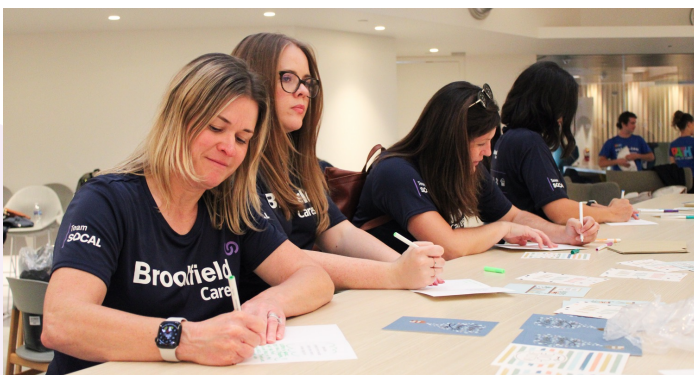
Brookfield Properties SoCal team assembling welcome home kits.