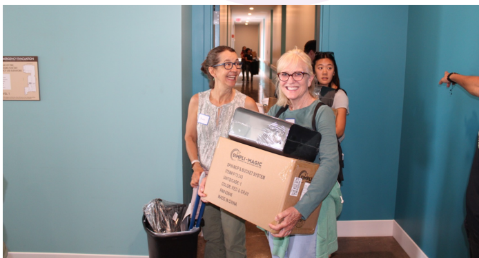
Volunteers lend helping hands to move in our residents.