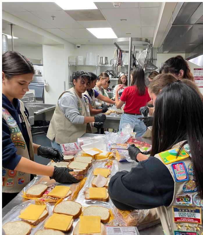
Girl Scouts making a difference, preparing over 80 sandwiches for our outreach teams.

PATH relies on an incredible network of volunteers, corporate partners, and donors to enrich and support our programs across the state. Last year, we partnered with community and corporate groups, schools, and faith institutions to create thousands of hygiene kits for our unsheltered neighbors, cook meals for our participants in interim housing, and provide individuals and families with critical household essentials as they moved into permanent housing.